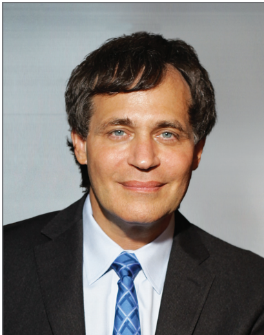
By Alan Kling, MD

Unwanted hair is a common problem. For the majority of patients with this complaint, laser hair removal (LHR) provides a safe and effective solution. The long-term results are better than temporary fixes like shaving, waxing, electrolysis, chemical depilatories and plucking. The usual sites treated with LHR are facial areas such as the upper lip and chin, the neck, bikini area, back, thighs, arms, and armpits.