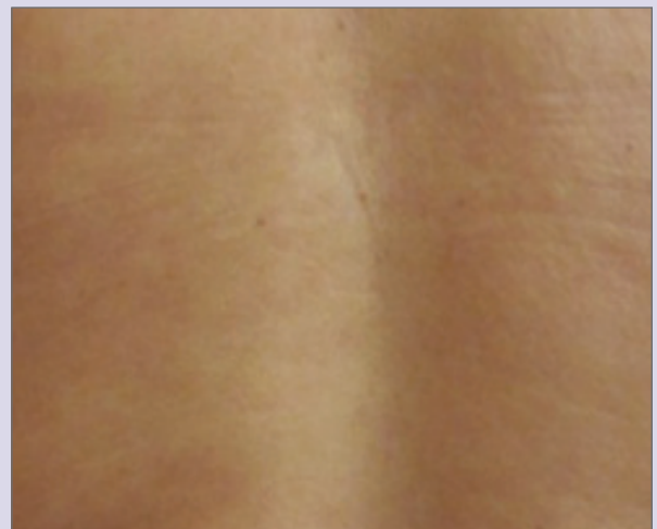
Photos show severe psoriasis on a patient's back (above), which cleared after two months of treatment with an experimental biologic drug and remained clear during 10 months of treatment (below).